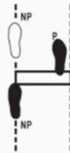
No. 3 LEGAL P = In Contact (Legal) NP = Contact/Within (Legal)