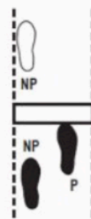
No. 6 LEGAL P = In Contact (Legal) NP = Behind/Within (Legal)