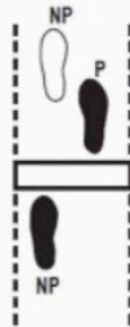
No. 5 ILLEGAL P = Not In Contact With (Illegal) NP = Behind/Within (Legal)