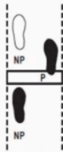
No. 1 LEGAL P = In Contact (Legal) NP = Behind/Within (Legal)