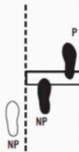
No. 8 ILLEGAL P = In Contact (Legal) NP = Backward Step Totally Outside (Illegal)