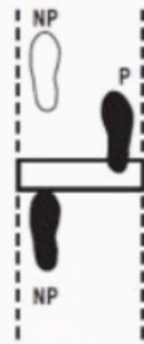
No. 2 LEGAL P = In Contact (Legal) NP = Contact/Within (Legal)